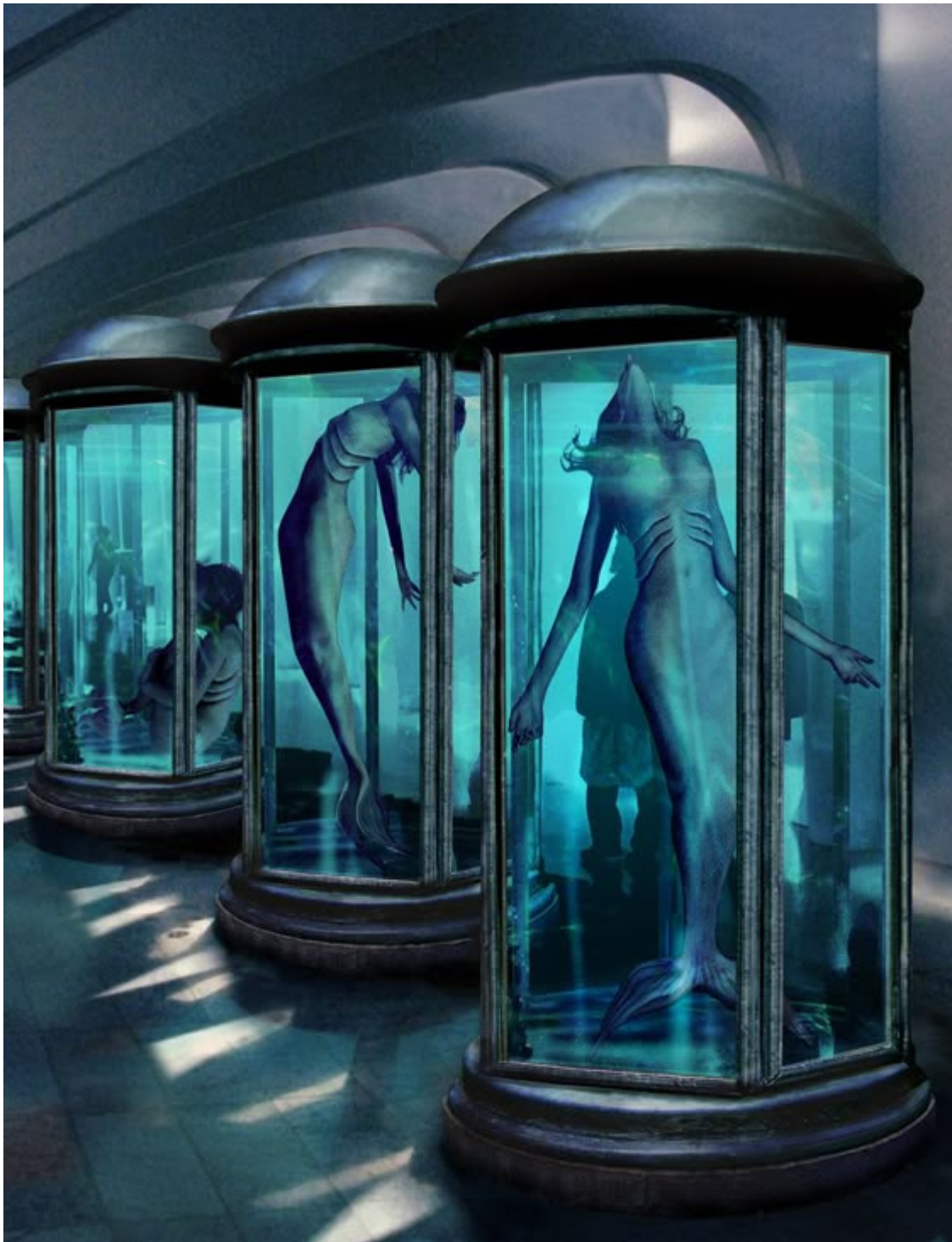
A friend released from captivity in the genetics lab: