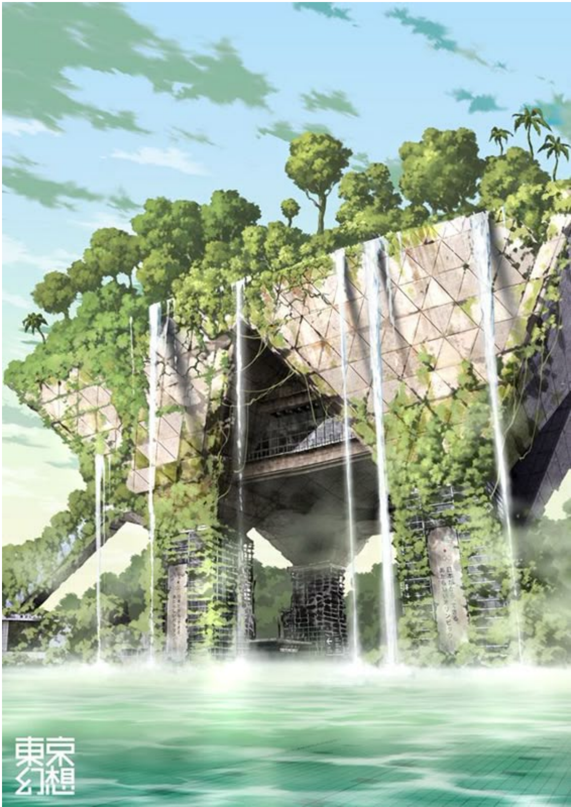
Keeshins, encountered first on the way down the long ramp leading down from “The Palace” at Bay Village: