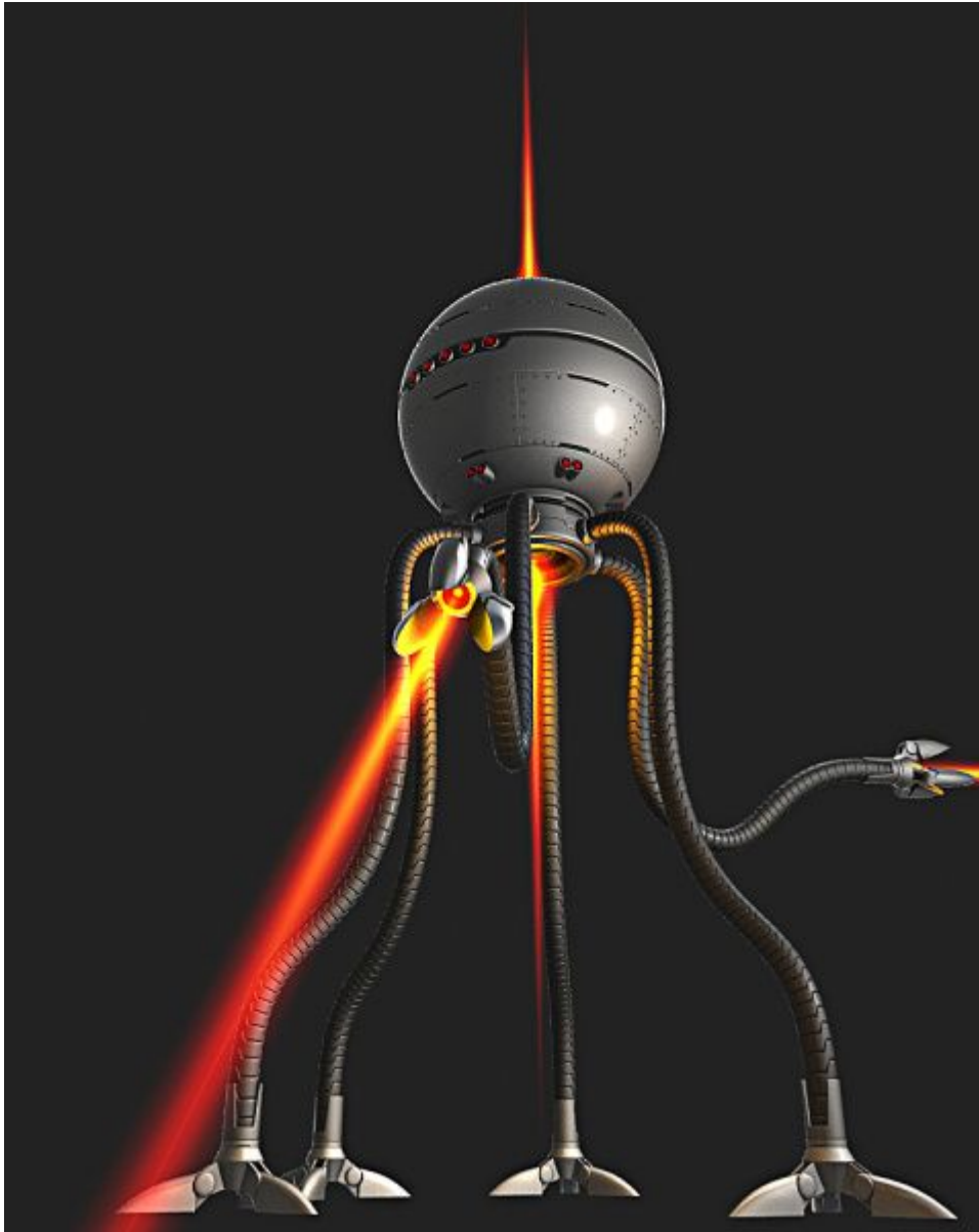
Captive meroids in the genetics lab: