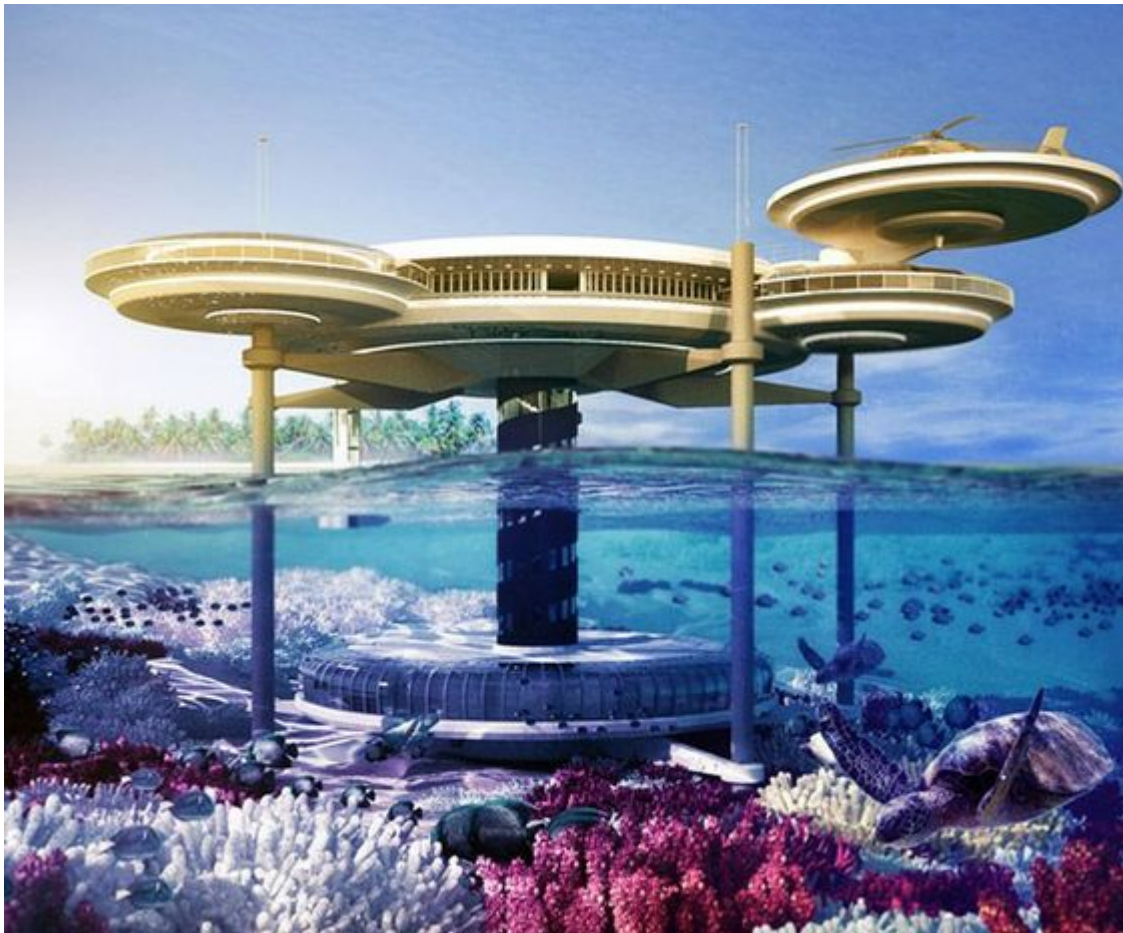
Cam's underwater base: