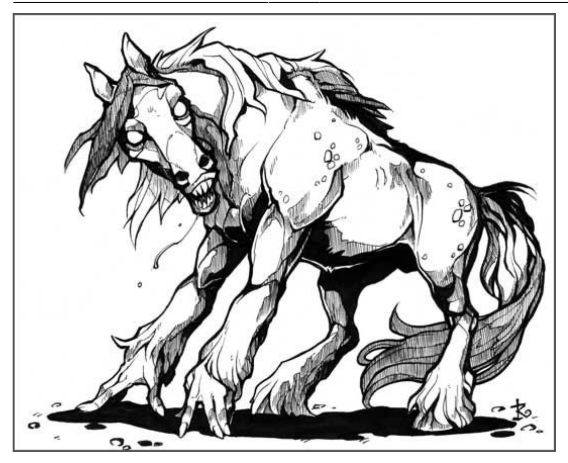
Wrangler Clan scavenger of the City Ruins:

2025/08/24 22:45 3/7 City Ruins of the Peninsula