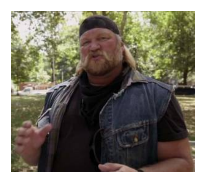
Axe's favorite toy:

Code-name of a burly shotgun-toting biker member. Axe likes to take trophies, including an ogre that he had to shoot with his shotgun many times to bring down; it is kept in an old sensory deprivation tank filled with preservative.