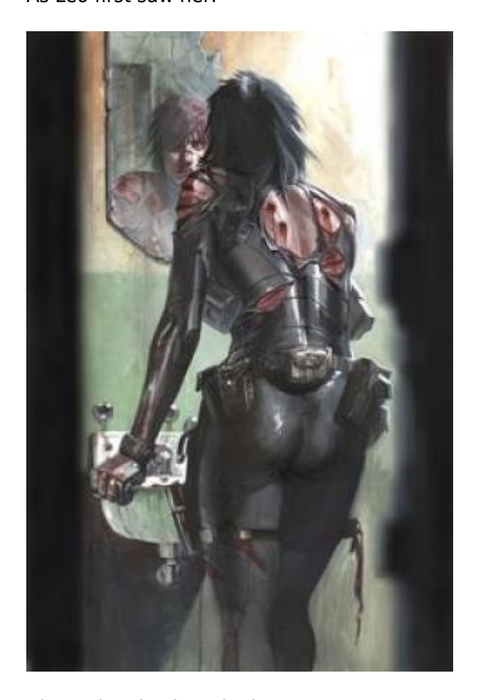
Cleaned up back at the base: