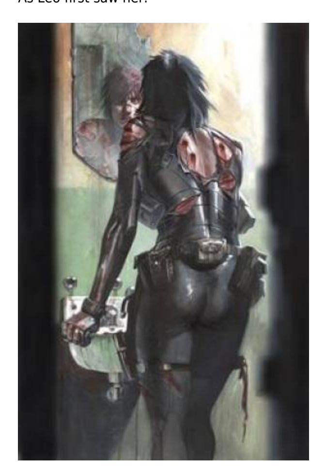
Cleaned up back at the base: