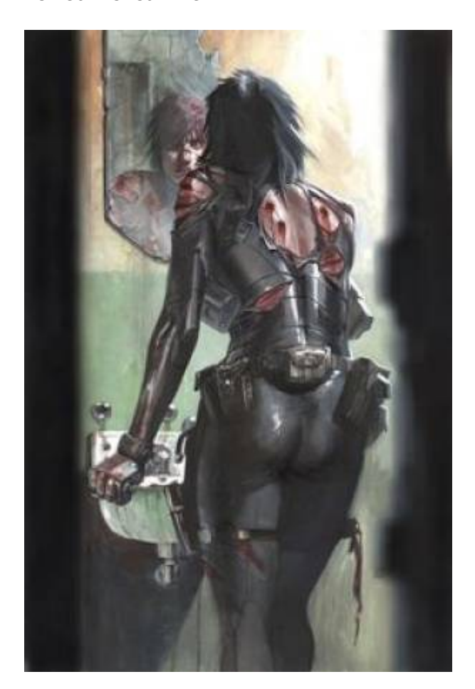
Cleaned up back at the base: