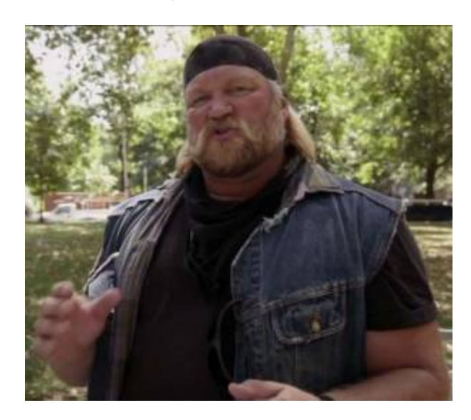
Axe's favorite toy:

Code-name of a burly shotgun-toting biker member. Axe likes to take trophies, including an ogre that he had to shoot with his shotgun many times to bring down; it is kept in an old sensory deprivation tank filled with preservative.