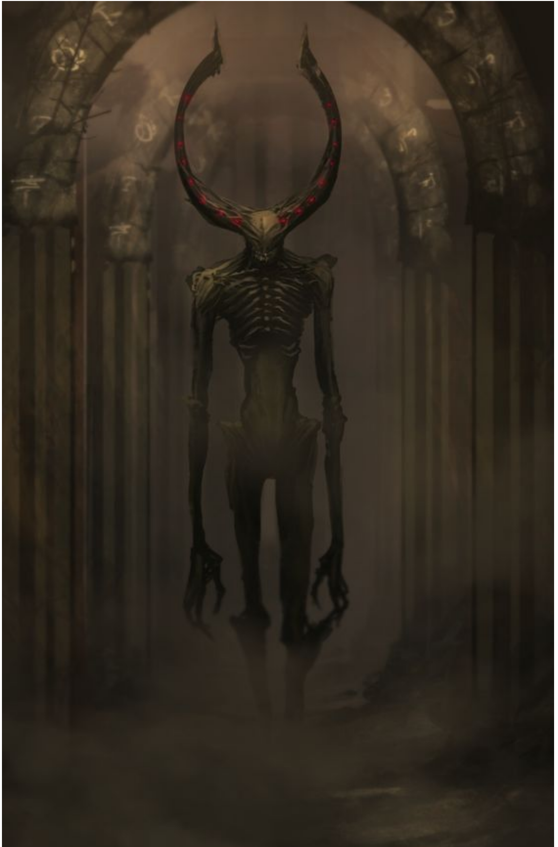
The Lord of Lies:

When one leaves the Black Chamber it's often "night time" outside, and the moons pour down fire into the lakes that one cannot reach.